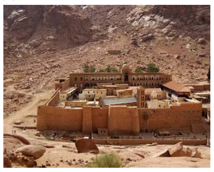
St Catherine's Monastery, Mount Sinai

http://are luctants inner.blogspot.com/2012/05/ark-of-wilderness-prepares-to-share-its.html