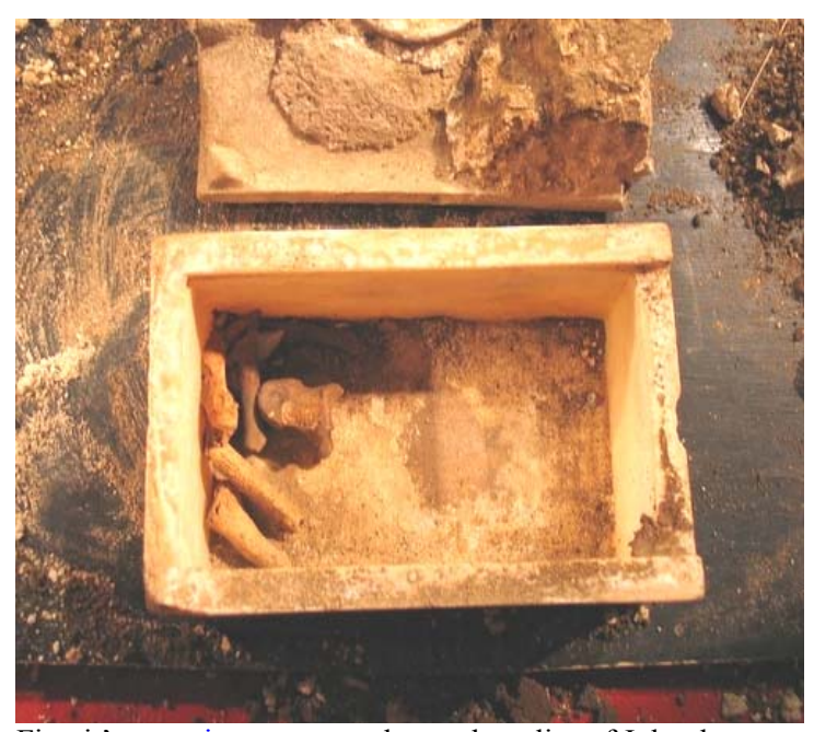
First it's <u>vampire graves</u>, and now the relics of John the Baptist: Bulgaria is just totally cornering cool archaeological news for the month of June. Go Bulgaria! It almost makes us want to forgive you for trying to kill Bl. John Paul the Great. Almost.