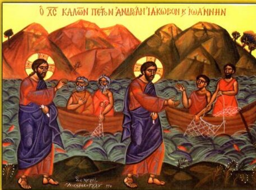
Icon of the Call of the First Apostles